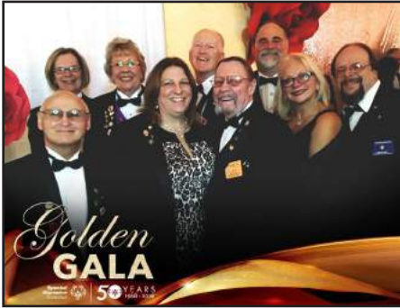
Special Olympics Gala

On May 16th, the CT Elks Annual Golf Tournament will be held at the Windham Golf Club. If you are not a golfer, go to the CT Elks Website and click on the golf tab to get