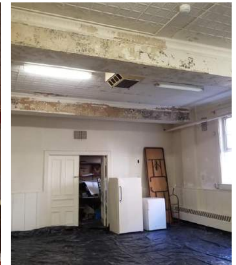
The back bar and the former card room were scraped and patched this month. Priming, painting, and installation of a smoke eater in the card room are next. We need your help!

The lodge held a successful cleanup/renovation day on Saturday, June 15th, focused on the former card room and back bar areas. Trustee Aldo LoDuca and Elk of the Year Gary Gramolini led the efforts to clean, organize, scrape, and patch the walls in both rooms. There is still work to be done! Now that the patching is done, we need some help doing the priming and painting. We're trying to set this up so that members can come in and do the work at their own pace. We will also be setting up a few more work days to get the job done. Check our Facebook page and bulletin board at the lodge to find out when the work will be done, or email elks360@gmail.com . Please come out and help us. We're very excited about having these two rooms available to our members and finishing up the work in them. Finally, thanks to Willimantic Elks members Pat Cristadore and Exalted Ruler Don Meakum for coming down to help us out.