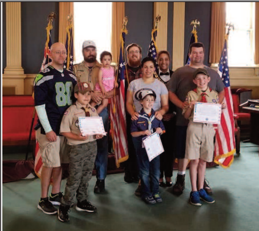
Cub and Boy Scouts are pictured with their families receiving certificates of appreciation for their support of Flag Day.